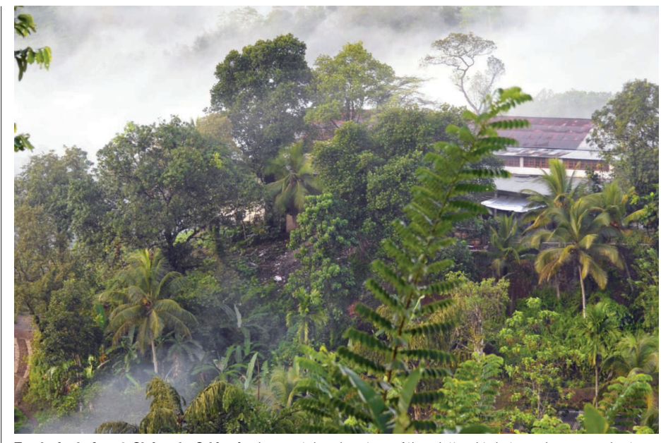
Tropical rain forest, Sinharaja, Sri Lanka. In recent decades, views of the relationship between humans and nature have changed in tandem with increasing impacts of human activities on natural systems.

threats to species and habitats from humans, and on strategies to reverse or reduce them. Ideas concerning minimum viable population sizes and sustainable harvesting levels, as well as intense debates about community-based management and the sustainable use of wild-