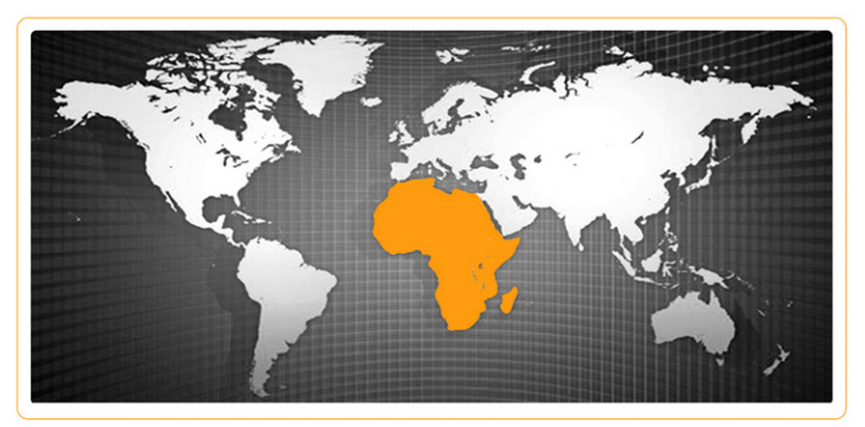
"Because It Is YOUR Land, YOUR Natural Resources!

...Jarch combines its knowledge of geopolitics, logistics and security in Africa to enhance the value of its assets."